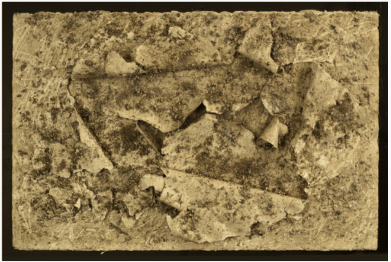
Sandy, Wall Street, 2012. Dirt from Lower Manhattan and acrylic gel on paper, 27 x 38" framed.