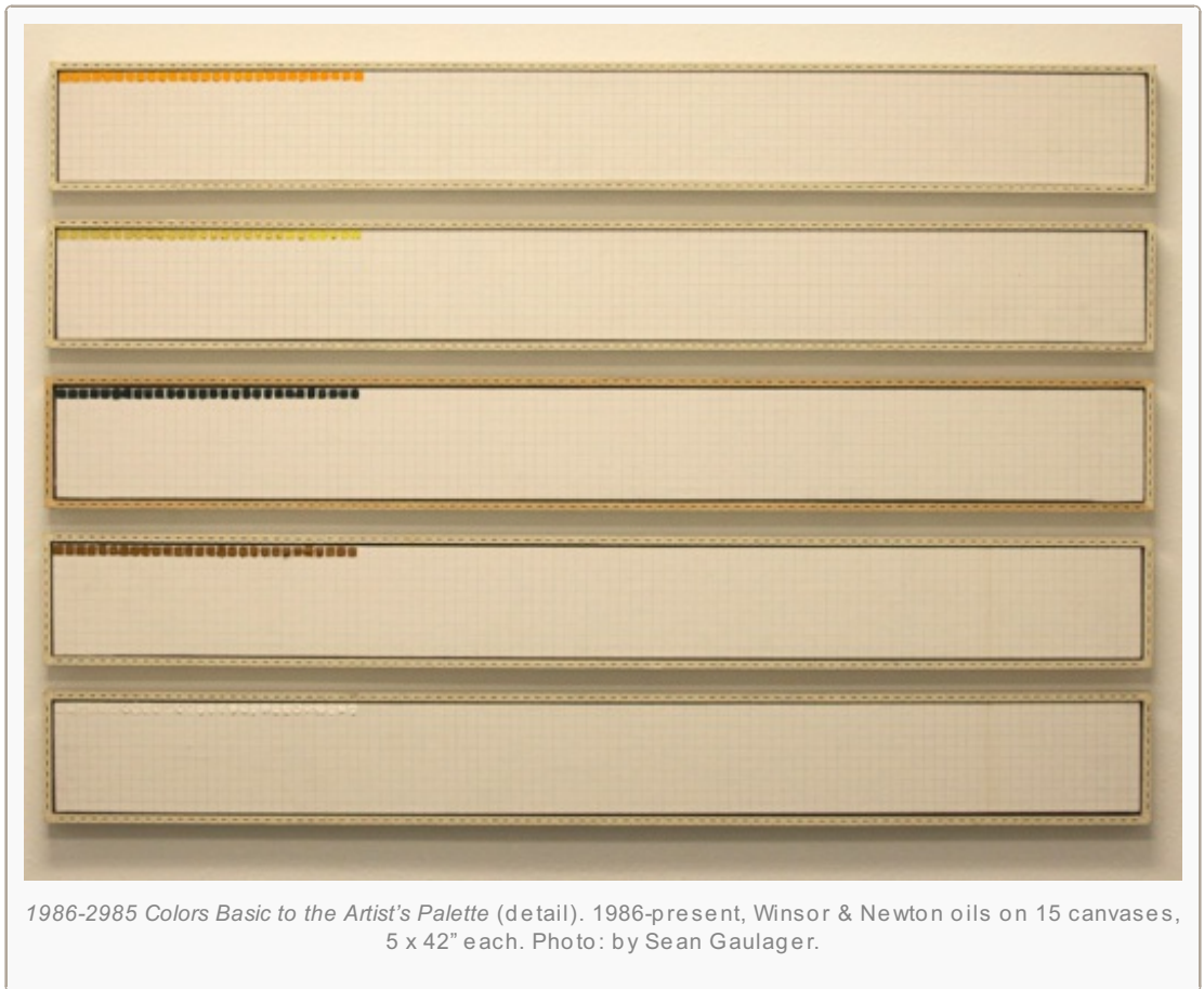
1986-2985 Colors Basic to the Artist's Palette (detail). 1986-present, Winsor & Newton oils on 15 canvases, 5 x 42" each.

A simple idea—Winsor & Newton oil colors throughout the years—but with career-defining consequences. He divided large canvases into 1,000 rectangles, dating the frames 1,000 years into the future, and proceeded to apply one blob of color straight from the tube each year, represented here by the fifteen-part 1986-2985 Colors Basic to the Artist's Palette . Another illustration of dynamic linear time, albeit with more luxurious materials, is 1000 Years From Now, 1979-2978 , cast gold and sterling silver cubes filed and