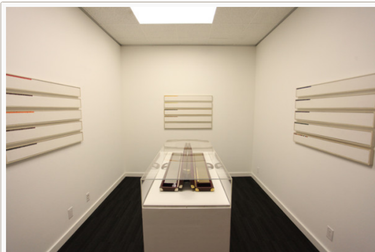
1000 Years From Now, Now, Now, Now, Now... at Co-Lab Projects N Space.