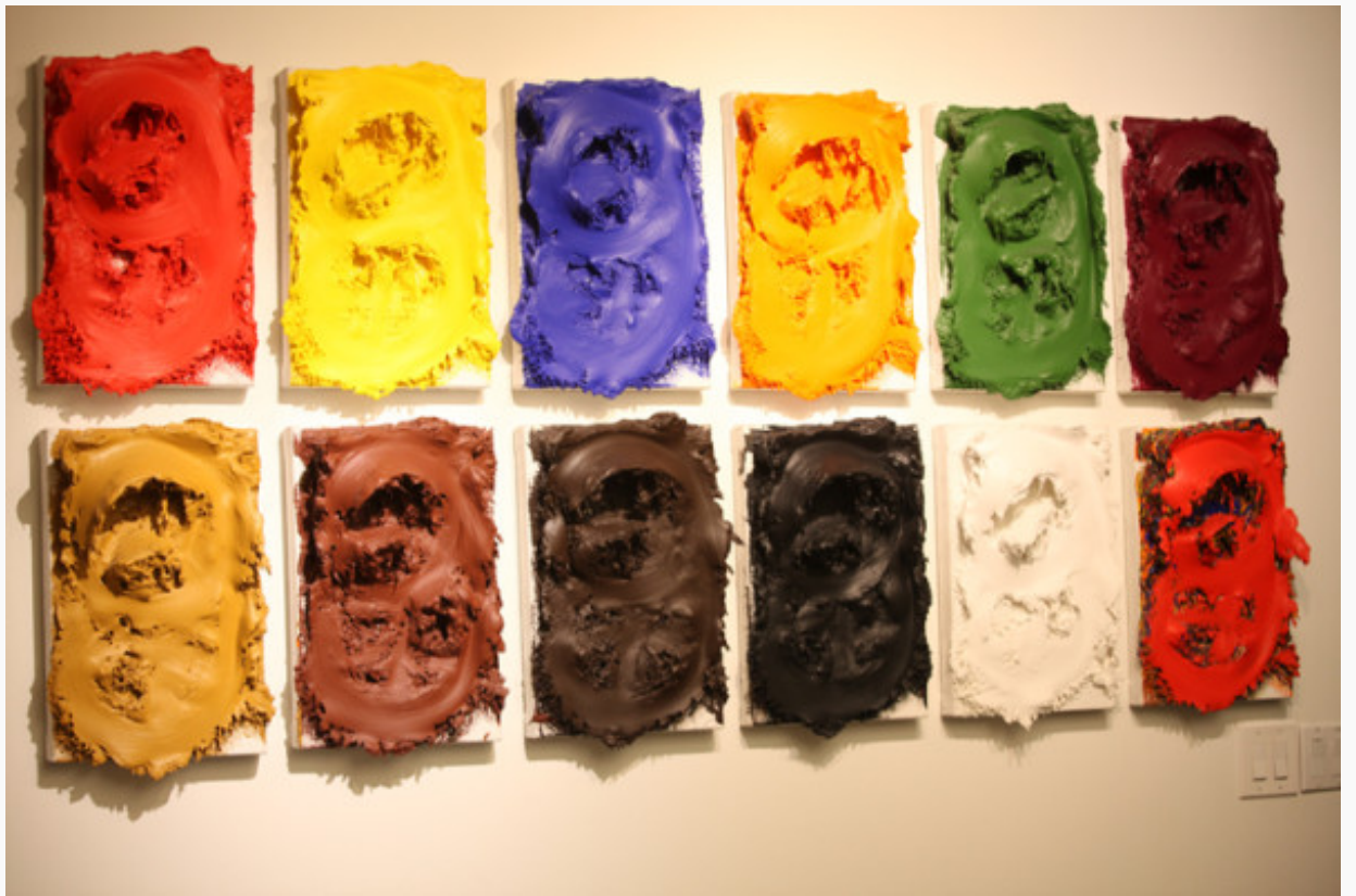
2000=3000 Millennium Series , 1993. Acrylic on 12 canvases, 18 x 12" each.

While continuing both series, van Lingen shifted to nonlinear and experiential time, swapping grids for