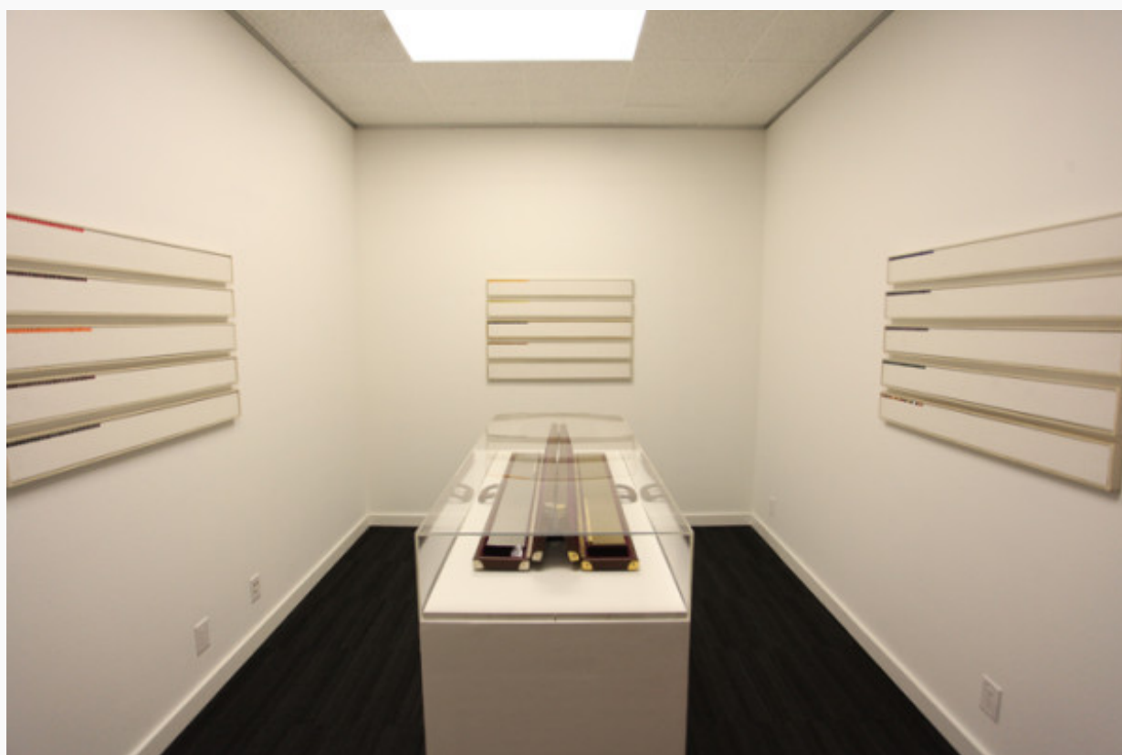
1000 Years From Now, Now, Now, Now, Now... at Co-Lab Projects N Space.